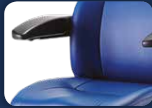
Cushions Body contoured cushions for comfort and support