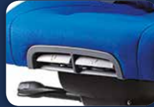
K4 Cushion length and tilt adjustment