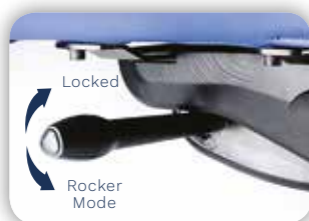
Rocker Tension To ensure optimum seating position