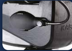
Air Lumbar To give good lower dorsal support