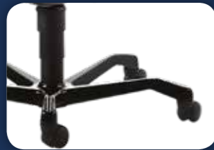
New KAB 5 Star Base Durable stylish black aluminium base