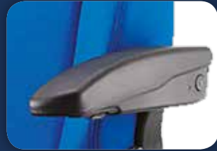
Tip-up Armrest 30° tilt adjustment to maximise elbow and arm support. Retractable for desktop access