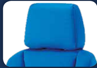
Headrest Height/Tilt adjustable