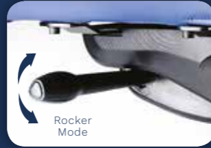
Rocker Tension To ensure optimum seating position