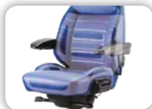
KAB Air Comfort System (ACS) To mould the chair simply press the + symbol to inflate and - symbol to deflate. Main charge is supplied to boost the 12v rechargeable battery every 3-4 months (subject to usage)