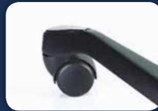
Castors Robust black double wheeled castors