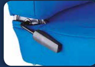
Backrest Angle Support 16° range to maximise user comfort